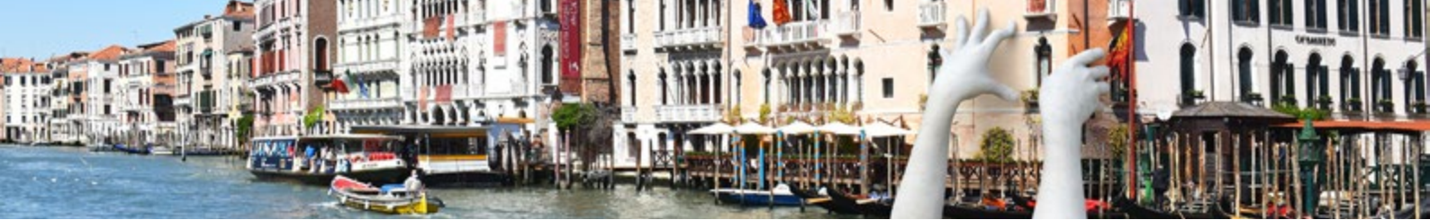
Lorenzo Quinn - Venice Biennale 2017