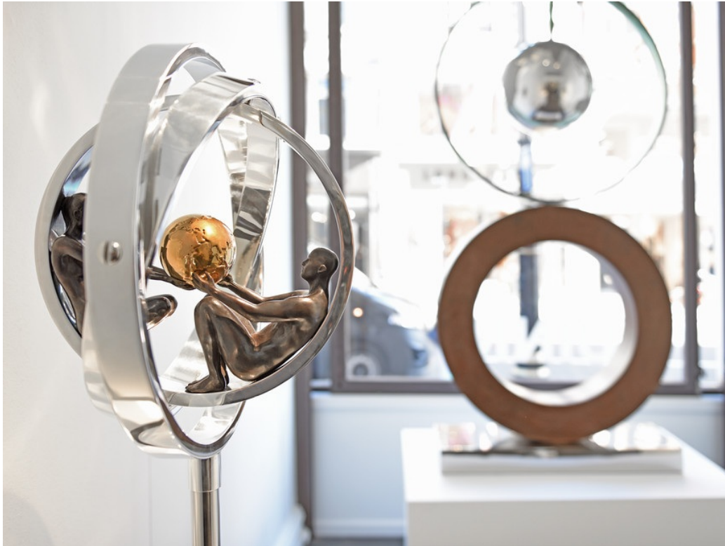
Lorenzo Quinn, Centre Of My Universe. Courtesy of Halcyon Gallery

4 — 25 Oct 2016 at Halcyon Gallery in London, United Kingdom